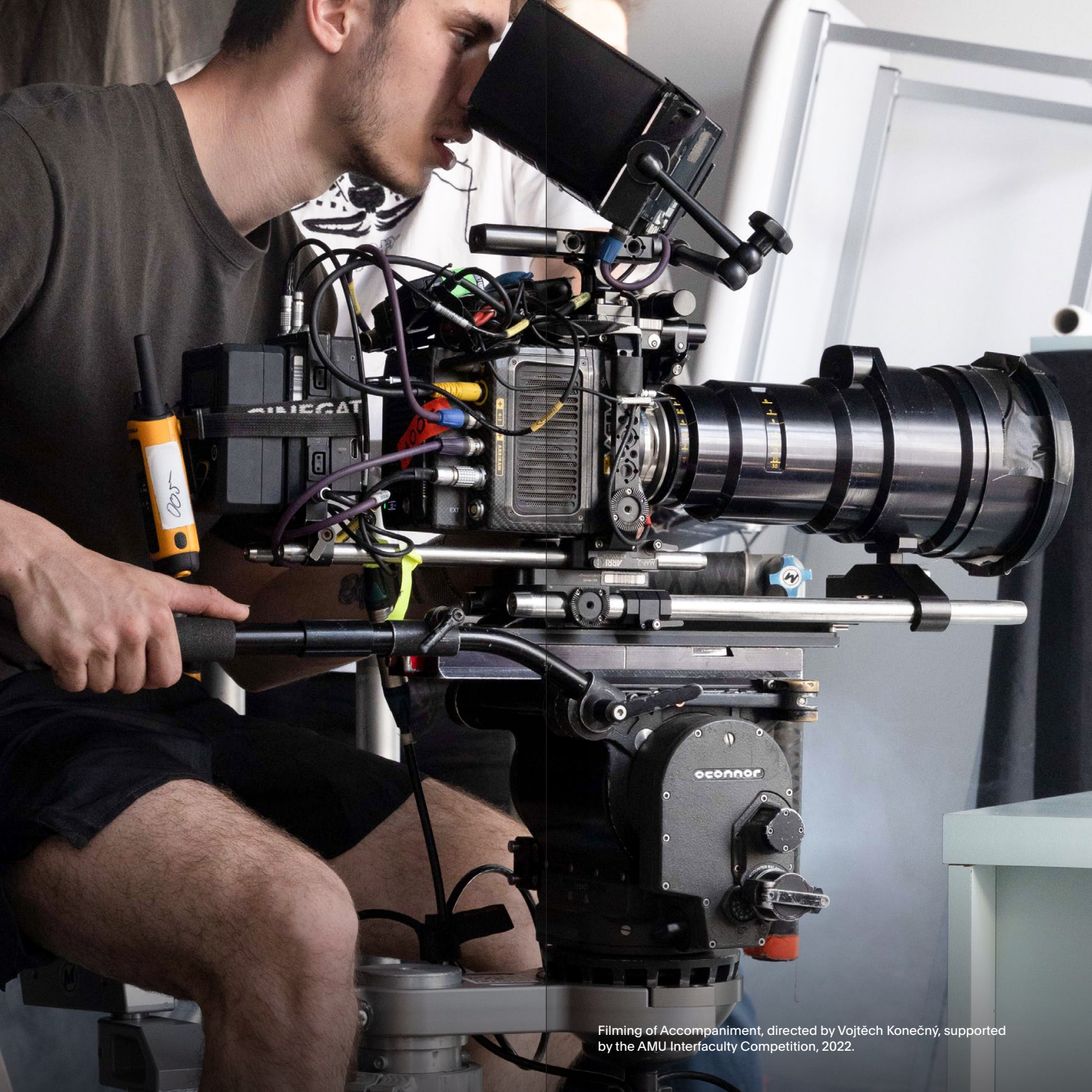
Filming of Accompaniment, directed by Vojtěch Konečný, supported by the AMU Interfaculty Competition, 2022.