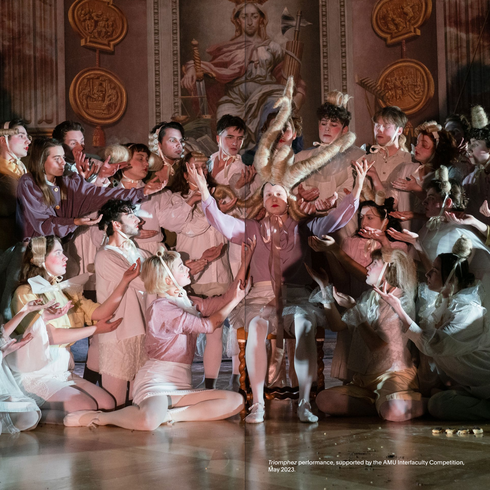
Triomphez performance, supported by the AMU Interfaculty Competition, May 2023.