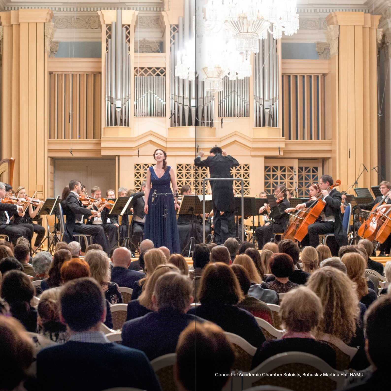
Concert of Academic Chamber Soloists, Bohuslav Martinů Hall HAMU.